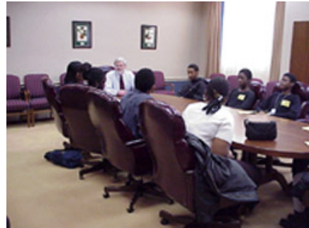
Senior High School students visit the U.S. Department of Agriculture in Washington, DC