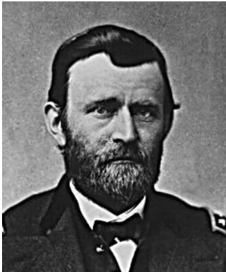
General Ulysses S. Grant