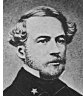
Robert E. Lee