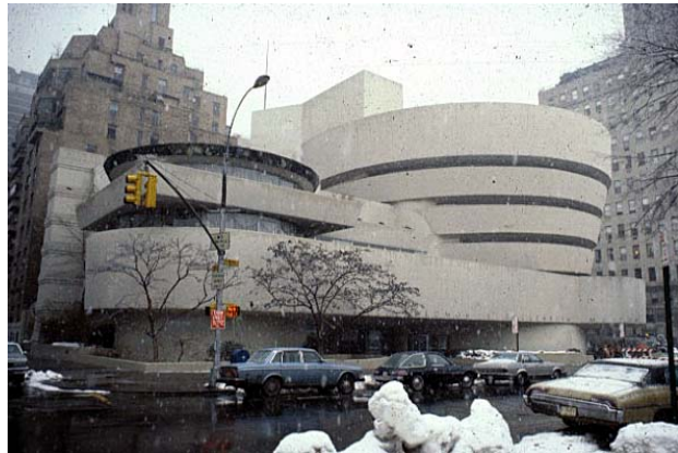
Guggenheim Museum in New York City