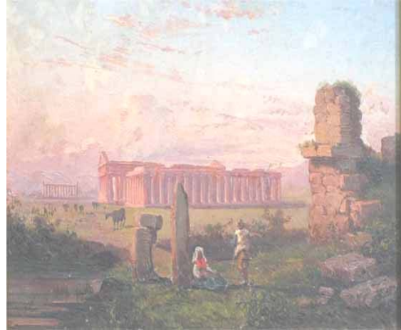
Hudson River school